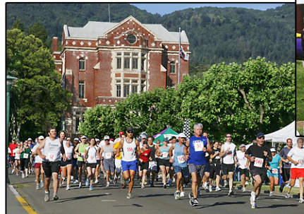
Photos: Upper right: The festival Above: The race/walk starts Right: Part of the 10K course