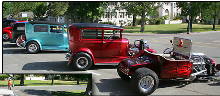
Part of the Car Show

active.com Discover. Register. Participate!