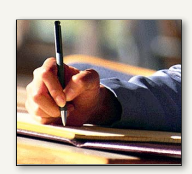
Send a letter