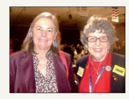
Make a visit