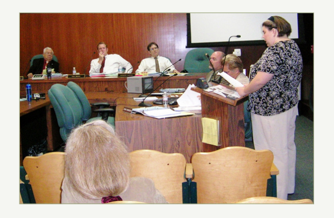
Area Board 9 Board of Directors