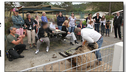
Lamborghini gets sheared

Although the weather had not yet turned very warm, they were ready for their summer trimming. The shearer was also kind enough to answer questions from the people watching. Many of the spectators picked up pieces of wool and were able to feel how much lanolin is in the raw wool. Everyone enjoyed watching the shearer do his job and afterwards most people toured the rest of the farm to say “hello” to the other animals.