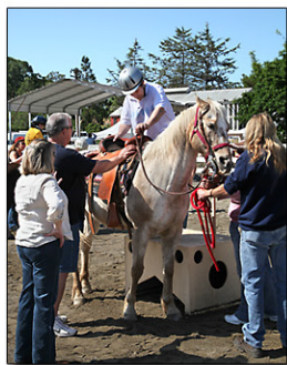
Mounting a horse at the Horse Show

T he Annual Horse Show for the people who reside at Sonoma Developmental Center (SDC) occurred on Saturday May 21, 2011 from 9:30 AM to noon at the outdoor equestrian arena at the facility. The Annual