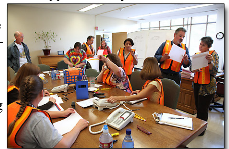
The Resource Room in action

primary focus of the training exercise was to test the readiness and effectiveness of the major emergency procedures for accounting and reporting for clients, staff, and all others as well as implementing