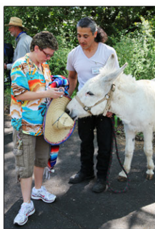
Sonny the burro advising a couple of photographers at Cinco de Mayo