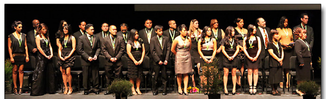
Napa Valley College Psychiatric Technician graduating class