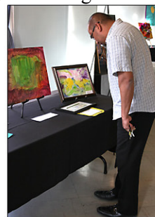
Checking out some work on display at the Art Show

The Art Show is a very popular event at Sonoma Developmental Center (SDC). The residents enjoy creating the art and then showing it off. The Art Show was not only opened to those residing or employed by SDC, but to the public as well.