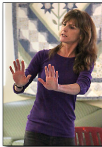
Demonstrating “No! Go away!”

There was also a discussion on “harmful words,” what they are and how to deal with them. The workshop also offered staff the tools on how to help students maintain information they had learned after the class was over. Some of the topics covered included: Staying at arms length, reading the body language of a grumpy person, walking away when upset and practice saying, “No. Go away!”