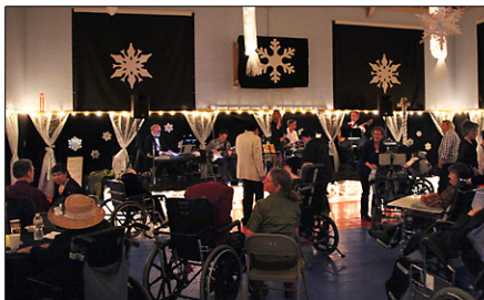
At the Black and White Ball

Upon entering the gala, the guests were greeted by a coat checker and escorted to their seat by an usher.