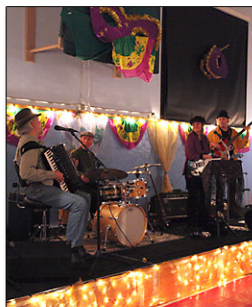
The band at Mardi Gras

photo booth, which was lavishly decorated with bright colors and with many costume items, including decorative hats, beads and masks. Once the band started playing, there was no holding back. From the colorful drinks, to the festive décor, the SDC gymnasium was the place to be on this cold winter night.