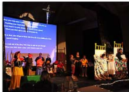
"When You Wish Upon a Star" from The Adventures of Mary Poppins