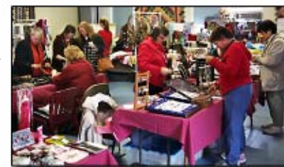
At the Holiday Craft Fair

With more than 20 vendors from Sonoma County each day, you were sure to find that perfect item! A raffle was held hourly with items donated by the vendors. Many employees and individuals from the community made their way through the Craft Fair seeking out those one-of-a-kind gifts.