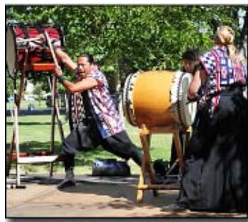
Shodan Taiko drummers perform at Celebrate Sonoma

Activities at Celebrate Sonoma included a variety of games as well as a temporary tattoo booth, the ever-popular photo booth and visits by the Eldridge Farm animals.