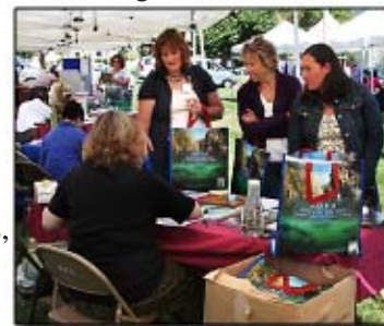
The Sonoma County Water Agency gave out colorful bags at the Wellness Fair

The Annual Wellness Fair was held on August 4 at the gymnasium and surrounding lawn area. The event, sponsored by the Wellness Committee, a committee made up of Sonoma Developmental Center employees, featured a dance performance by the Redwood Country Cloggers, and informational booths such as the Sonoma County