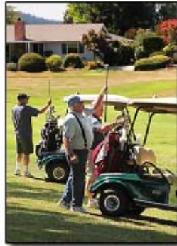
Golfers at the Golf Tournament

The Golf Committee would like to thank the many donors and volunteers that helped to make the event the success that it was.