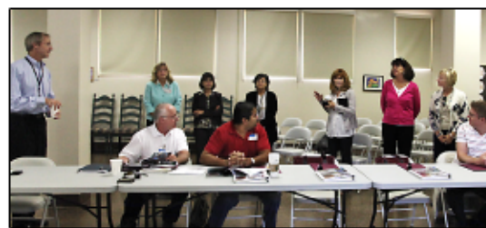
The Executive Team greets the Behavior Support Services Workgroup