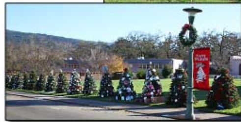
Christmas Tree Lane