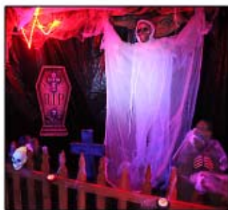
A room in the Spook Hall

S onoma Developmental Center (SDC) began the Halloween observance the week of October 18, with the opening of the annual Spook Hall located at REACH, the facility's community center. The Spook Hall has been operating at Sonoma Developmental Center since the 1970s and has evolved from a one-room sensory spook house to a large maze of