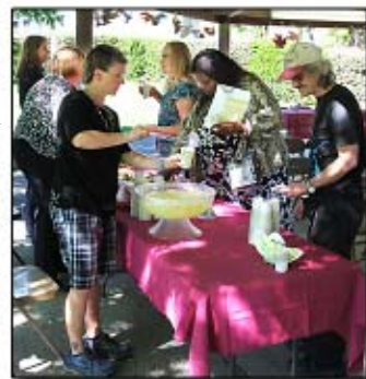
Serving refreshments at Remembrance Day

Many of the residents at SDC created a colorful array of paper doves that were on display at the Butler gazebo during the ceremony in honor of the individuals being remembered.