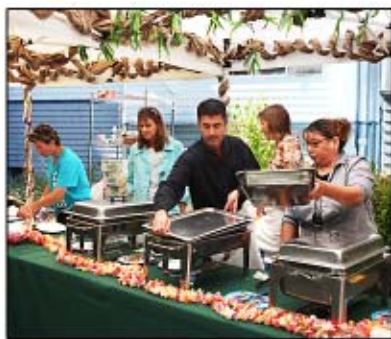
Staff set up food at Celebrate Sonoma

Everyone was treated to a luau-style feast of rice, fruit, and roasted pork and turkey with a variety of sauces, and refreshments, including lemonade, flavored shaved-ice