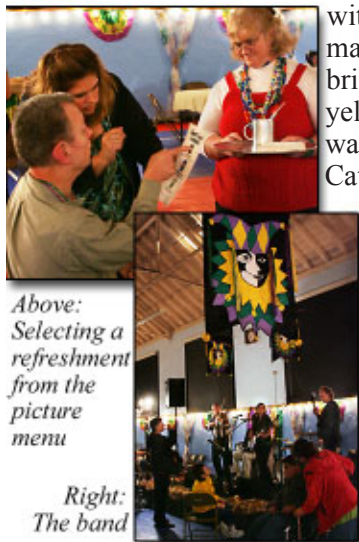
Above: Selecting a refreshment from the picture menu

On February 18, 2009, a dance was held in recognition of Mardi Gras. The gymnasium was decorated in true New Orleans fashion with colorful flags, oversized masks, and an abundance of bright glittery draping in green, yellow, and purple. Live music was provided by the Catahoulas, as “bartenders” served festive refreshments. A photo booth offered many costume items, including decorative hats, beads, and masks, which were sported all around the dance floor. This version of Bourbon Street was energetic, colorful, and festive!