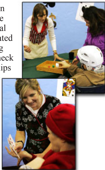
A variety of games were available at Casino Night

Casino night was held on January 28, 2009 at the Sonoma Developmental Center gym, which was decorated as a Reno or Las Vegas gaming hall. Staff were on hand to check coats and distribute gaming chips as individuals arrived to play a variety of games. Gaming options included a horse race table, a roulette table, a dice table, and black jack tables. Music played as “cocktail waitresses” served refreshments to the gamers and those in the lounge area. Individuals could “cash in” their chips at the prize table and select from a variety of prizes. Everyone left with more than just a winning smile!