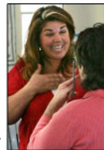
An actor is coached to demonstrate looking happy

The cast is comprised of approximately 40 singers, dancers, actors, and musicians. Volunteers are needed for this year’s performance to assist backstage, with rehearsals, props, costumes, and more. For information about volunteering at this year’s production, please contact the volunteer office at (707) 938-6213.