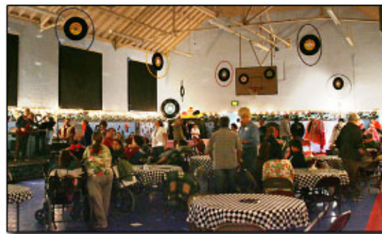
At the Sock Hop

in style refreshments were served from a stand offering root beer floats and fifty-fifties (orange soda with vanilla ice cream). Everyone was swingin’ and groovin’ at the Hop with live 50s rock and roll by the band Showtime until it was time to “stroll” home at the end of the night.