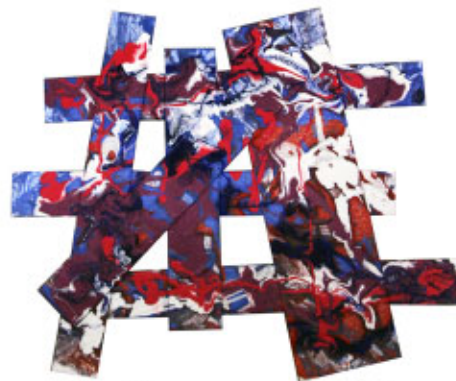
Artwork by an anonymous client (paint on wood slats)

Planning is already underway for a host of events that will be coming soon i.e., the annual fashion show, Cinco de Mayo festivities, the Opportunity Fair, the Sonoma Valley Footrace and Festival, and the July 4 th celebration, etc. For information about the Opportunity Fair, see the article on page 4.