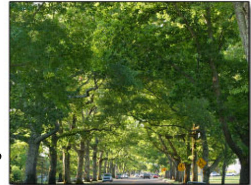
Driving through SDC

To request a tour for your group, contact the Public Information Officer at (707) 938-6703.