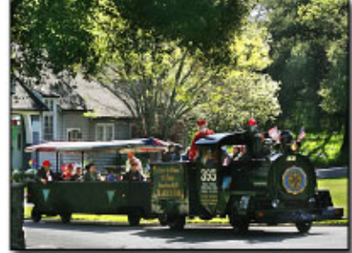
Voiture 395 from Solano County

These dedicated military men from Voiture #395 (Solano County) and Voiture #338