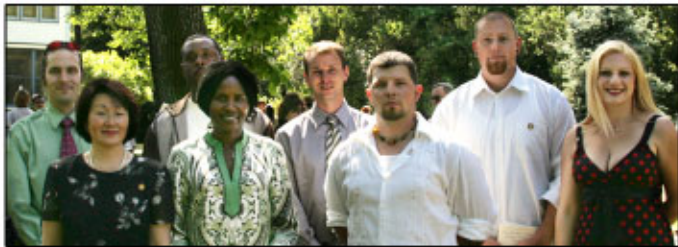
New psychiatric technician graduates: SRJC above, NVC below