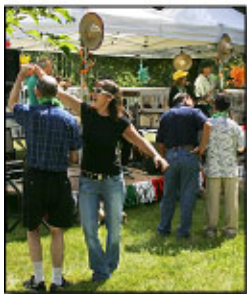
Dancing on the Sonoma House lawn at Cinco de Mayo

The Cinco de Mayo festivities kicked off in the morning at two locations. The first location is the beautiful Ordahl courtyard, which is set up to make it easy for the more physically fragile people to attend. The whole area was festively decorated in red, white, and green, and featured flowers everywhere. In addition to the Mariachi band, there were arts and crafts projects, games (with prizes), temporary tattoos, a photo booth, and refreshments available. The second morning location is on the Sonoma House lawns, also decorated in red, white, and green, and which featured another band, in addition to games, temporary tattoos, another photo booth, and refreshments.