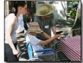
The "squirt gun" is actually a hose (but more fun!) at the Hoe Down

T he Hoe Down took place on Friday, May 16, 2008, a very warm day. The event was held on the courtyard of REACH, where many of the attendees could be observed sitting in the swinging outdoor patio chairs, swaying to the music. Some came dressed in their western attire, and many enjoyed the misters scattered throughout the yard. Everyone seemed to enjoy the annual shindig with live music, cool refreshments, a western style photo booth, and ever-so-popular squirt gun game. Prizes included straw cowboy hats, sheriff badges, squirt guns, bandanas, and other western-themed paraphernalia. It was apparent from all the smiles and laughter that everyone was having a wonderful time.