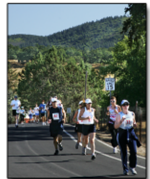
Last year's footrace