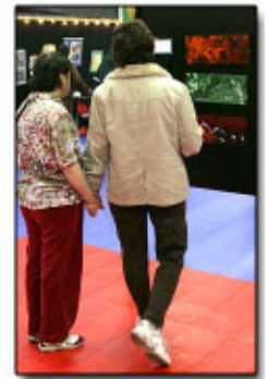
Admiring the art