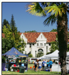
Last year's festival

The event will start off at 9 AM with a 5k run/walk and an advanced 10k run. Both courses run through the streets of SDC, with the 10k going off-road at times, offering a scenic view of the beautiful SDC campus. Advance registration fees for the race are $25 for adults and $15 for children 12 and under. On race day, registration is $30 for adults and $20 for children. All