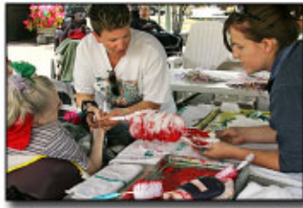
Crafts project in the Ordahl courtyard at Cinco de Mayo