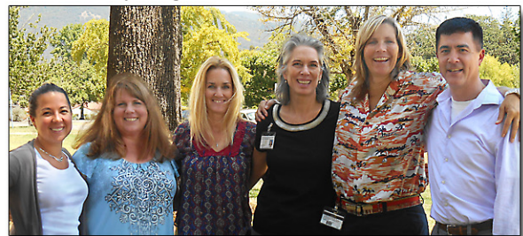
Employee Recognition Committee

• Kudos to the Employee Recognition Committee for the organization and implementation of the SDC Summerfest. The festivity was well attended and a great time was had by staff and residents! Way to go!