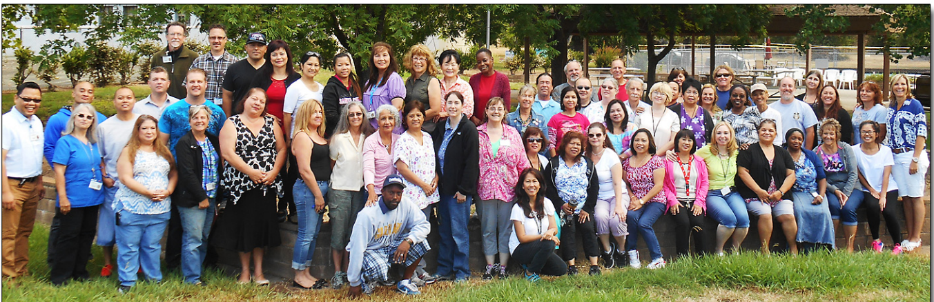
Central Program Services (CPS)