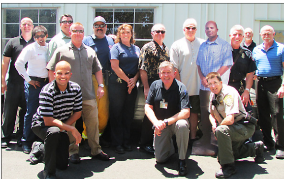
Office of Protective Services