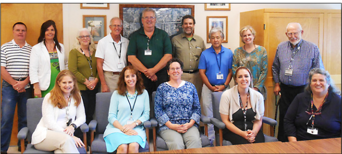
Department of Medicine