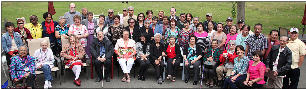
Foster Grandparent/Senior Companion Program