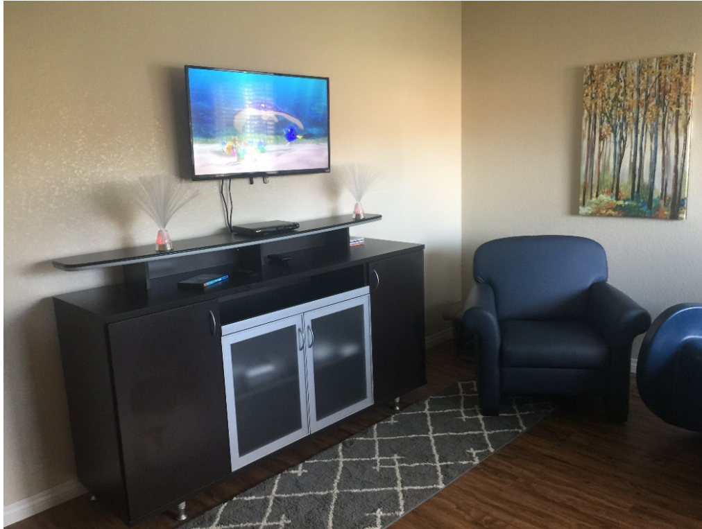
Shasta View - ANKA, Inc.