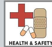
HEALTH & SAFETY