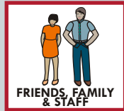
FRIENDS, FAMILY & STAFF