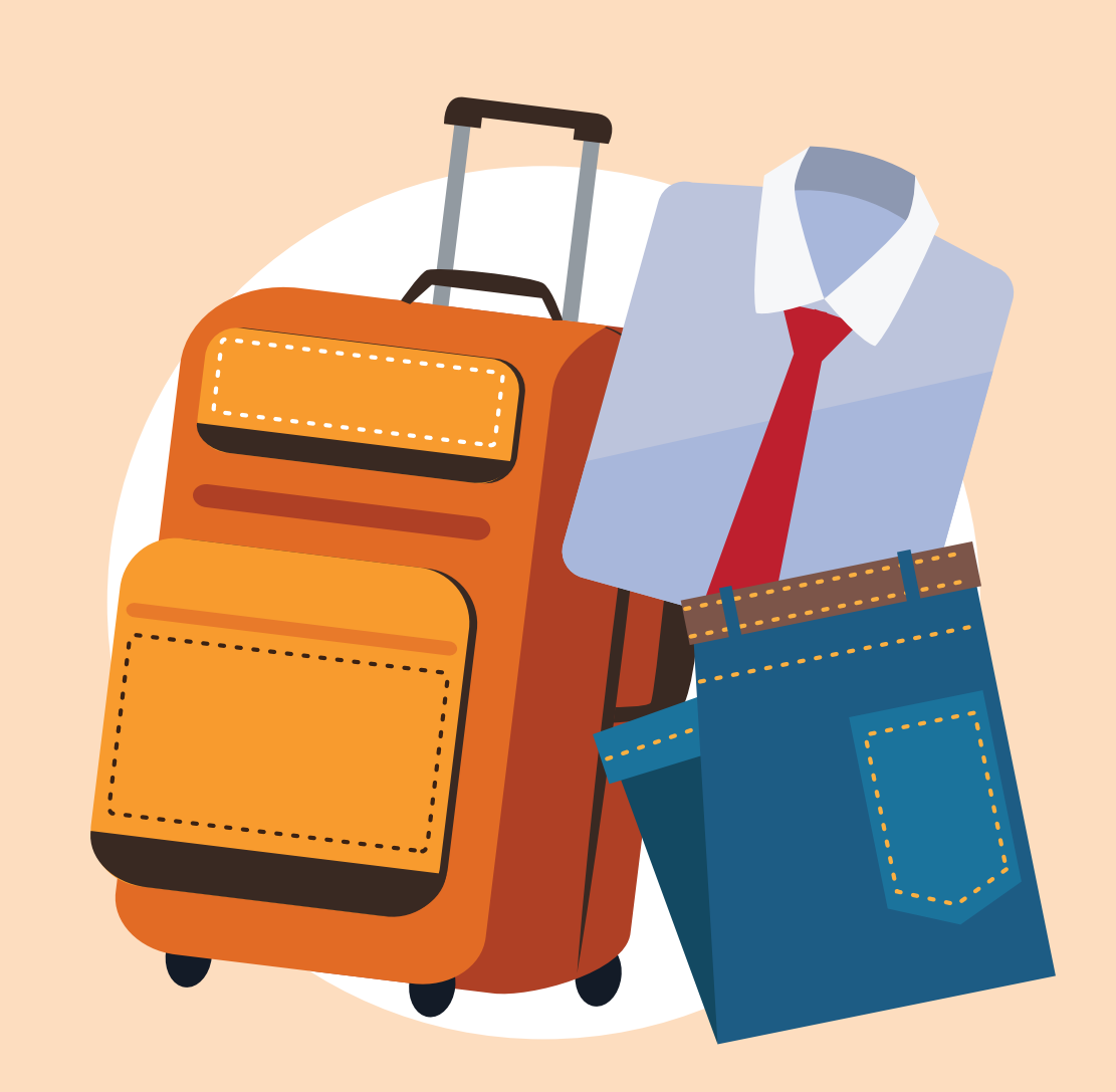
Know what supplies are in your kits.