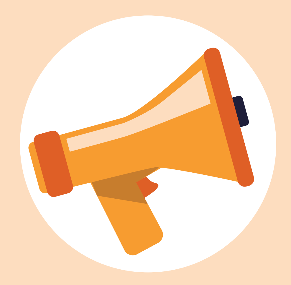
Practice evacuation drills with your staff and community.